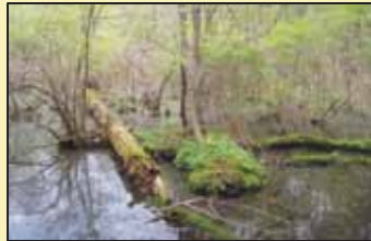
The Upper Cuyahoga Bog is an ecological gem.

"As we all know, stormwater runoff ignores community